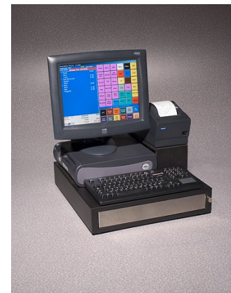
Lite System 19"W x 24"H x 21"D