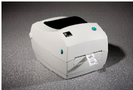
Heat Seal Printer 5.5" W x 7"H x 9.5"D