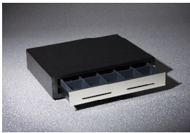
Cash Drawer 18.81"W x 15.18"D x 4.3"H