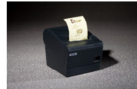
Thermal Printer 5.71"W x 5.83"H x 7.68"D