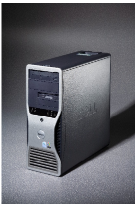
Dell Precision 6.8"W x 17.6"H x 18.4"D