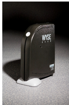
Wyse Thin Client 1.3"W x 6.94"H x 4.75"D