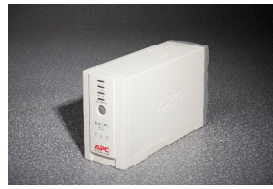
Battery Backup 3.60"W x 6.50"H x 11.2"D