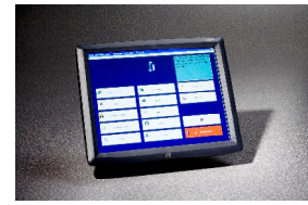
Flat Panel Touch Monitor 13.99"W x 11.27"H x 10.44"D